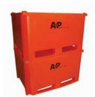
On lease and purchase contracts we can mark containers with your company logo.