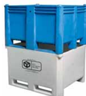
The Saeplast 605 is specially designed to inter-stack with Dolav box-pal type 1000 containers.