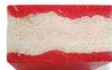
Double walled and insulated for optimum strength.